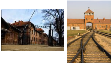
NAZI CONCENTRATION CAMPS

First, they came for the Communists, And I didn't speak up because I wasn't a Communist, Then they came for the Jews, And I didn't speak up because I wasn't a Jew. Then they came for the Catholics, And I didn't speak up because I wasn't a Protestant. Then they came for me, And by that time there was no one left to speak up for me.